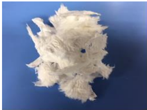
Chemically modified Cellulose

Below table indicates the basic physical properties of our CNF composite masterbatch with various type of resin.