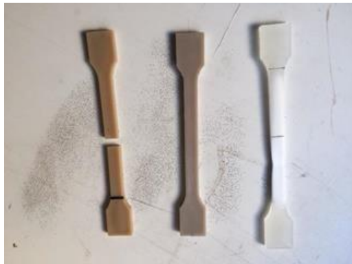
CNF mixed Plastic test pieces