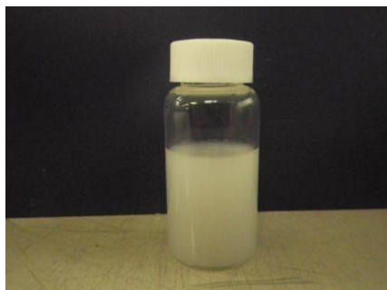
CNF dispersion in water